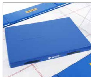
• Art. No. 28500 Spieth spotting mat „Secura“