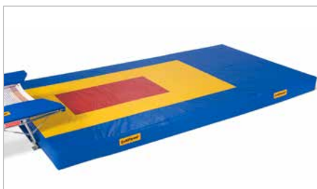
• Art. No. 26101 Landing mat cover