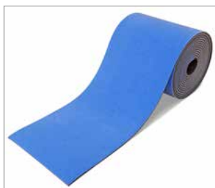
• Art. No. 23005 Run-up track